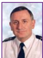
Sean Price Chief Constable - Cleveland Police